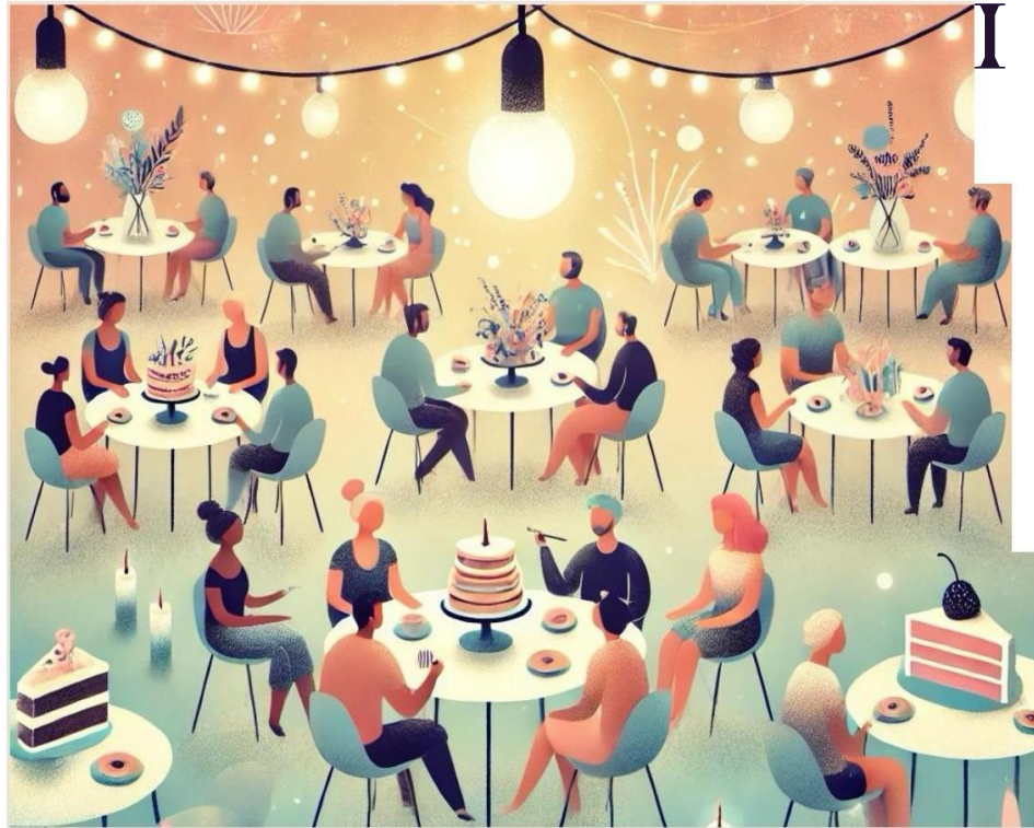
TABLE TALKS ALDERGROVE

SUBSTANCE USE & YOUR NEIGHBOURHOOD A DESSERT & DIALOGUE EVENING